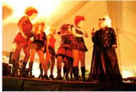
The reigning line of this party has a straight talk with her galle entourage.

Her Royal Majesty Invites All Funlovers to Her Black & White Party By Greg King