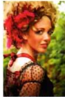
Ladies of remarkable beauty and grace appear.